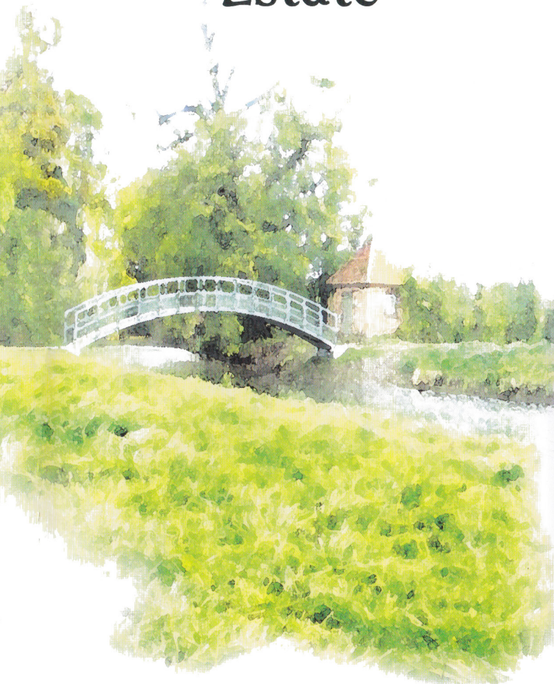
View of the The Fishpond Walk - the arched bridge leading to the Victorian changing rooms