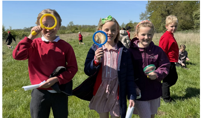
▲ Exploring wilder habitats

All sessions can be adapted to EYFS, KS1 and KS2, unless otherwise stated.